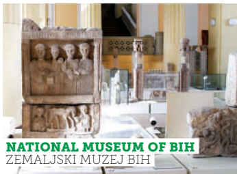
NATIONAL MUSEUM OF BIH ZEMALJSKI MUZEJ BIH

🏠 Zmaja od Bosne 3 📞 033 668 027 🕒 Tue-Fri/Uto-Pet: 10:00 - 19:00; Sat-Sun/Sub-Ned: 10:00 - 14:00