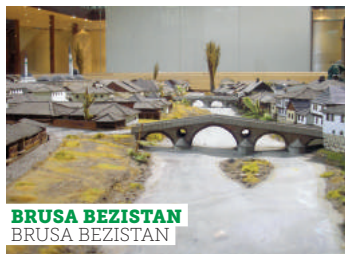
BRUSINA BEZISTAN BRUSINA BEZISTAN