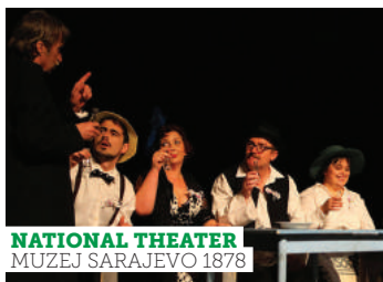
NATIONAL THEATER MUZEJ SARAJEVO 1878

📍 Obala Kulina bana 9 📞 033 226 431 🌐 www.nps.ba 🕒 Mon-Sun: 09:00 - 12:00 & 16:00 - 19:30 Pon-Ned: 09:00 - 12:00 & 16:00 - 19:30