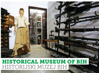
HISTORICAL MUSEUM OF BIH HISTORIJSKI MUZEJ BIH

🏠 Zmaja od Bosne 5 📞 033 226 098 🕒 Mon-Sun/Pon-Ned: 9:00 - 19:00