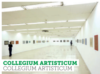
COLLEGIUM ARTISTICUM COLLEGIUM ARTISTICUM

📍 Terezije bb (Centar Skenderija) ☎ 033 204 352 🕒 Mon-Sat/Pon-Sub: 10:00 - 18:00