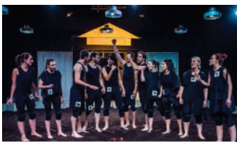
SARAJEVO WAR THEATER SARTR SARAJEVSKI RATNI TEATAR SARTR