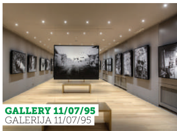
GALLERY 11/07/95 GALERIJA 11/07/95

📍 Fra Grge Martića 2 / III 📞 033 953 170 🕒 Mon-Sun/Pon-Ned: 10:00 - 18:00