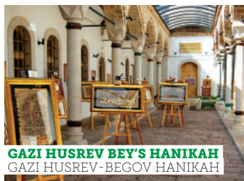
GAZI HUSREV BEY'S HANIKAH GAZI HUSREV-BEGOV HANIKAH

📅 APR 14 - 28: Gardens of Stolac - Garden of Europe , Collective Exhibition / Vrtovi Stoca, vrta Europe , kolektivna izložba